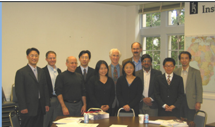
The 2003 Asia-Pacific Bilateralism Conference was held at the University of California, Berkeley from March 21-22.

conducted through theoretically informed and in depth analysis of the U.S., Japan, China, South Korea, Taiwan, Singapore, Malaysia, Thailand, and Mexico. The next conference on bilateralism will be held in Hawaii in December 5-6, 2003 and the findings of both conferences will be published in a book volume in the fall of 2004.